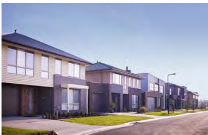
Completed homes at Argyle at Waterways

Construction has recommenced on site after 11 months, with homes along Beluga Street and Jubilee Boulevard currently being built for settlement mid next year.