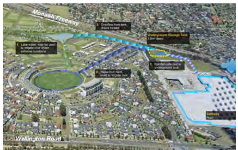
Schematic diagram of proposed Waverley Park Water Harvesting scheme

In these times where drought is an issue on everyone's mind, this initiative highlights Mirvac's commitment to finding sustainable solutions to help save and recycle water at our developments.