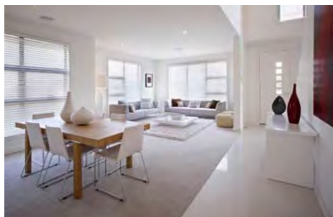
Display home at Argyle at Waterways