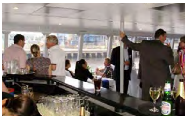
River Precinct purchasers enjoy a site visit with style