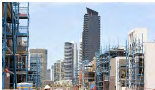
River Homes under construction

Construction is well progressed with finishing trades commenced. The anticipated completion of Stage 2 is currently scheduled for late 2010.