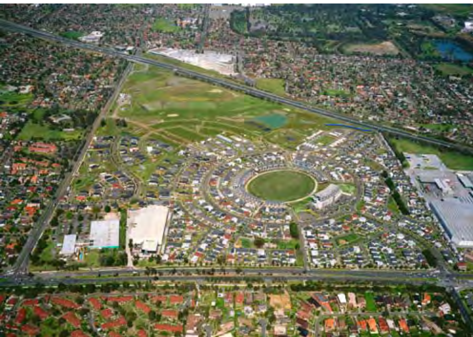
2009 Aerial image

Waverley Park has seen a number of significant milestones occur during 2009. The estate has continued to grow into a vibrant community, the 500th house and land settlement taking place in March and over 750 homes having been sold to date. The new Display Village was launched and construction was completed on Harmony 9.